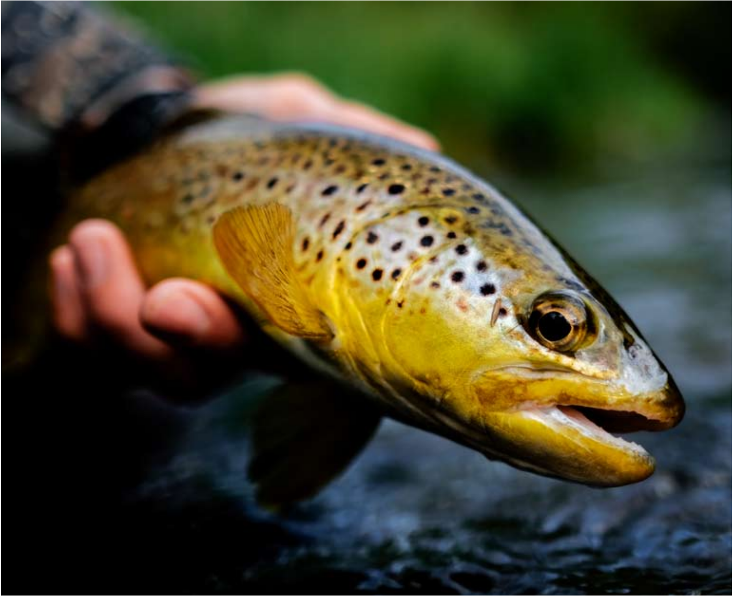
Darren Wishard with a nice brown

Next meeting will be September 16th, agenda TBD.