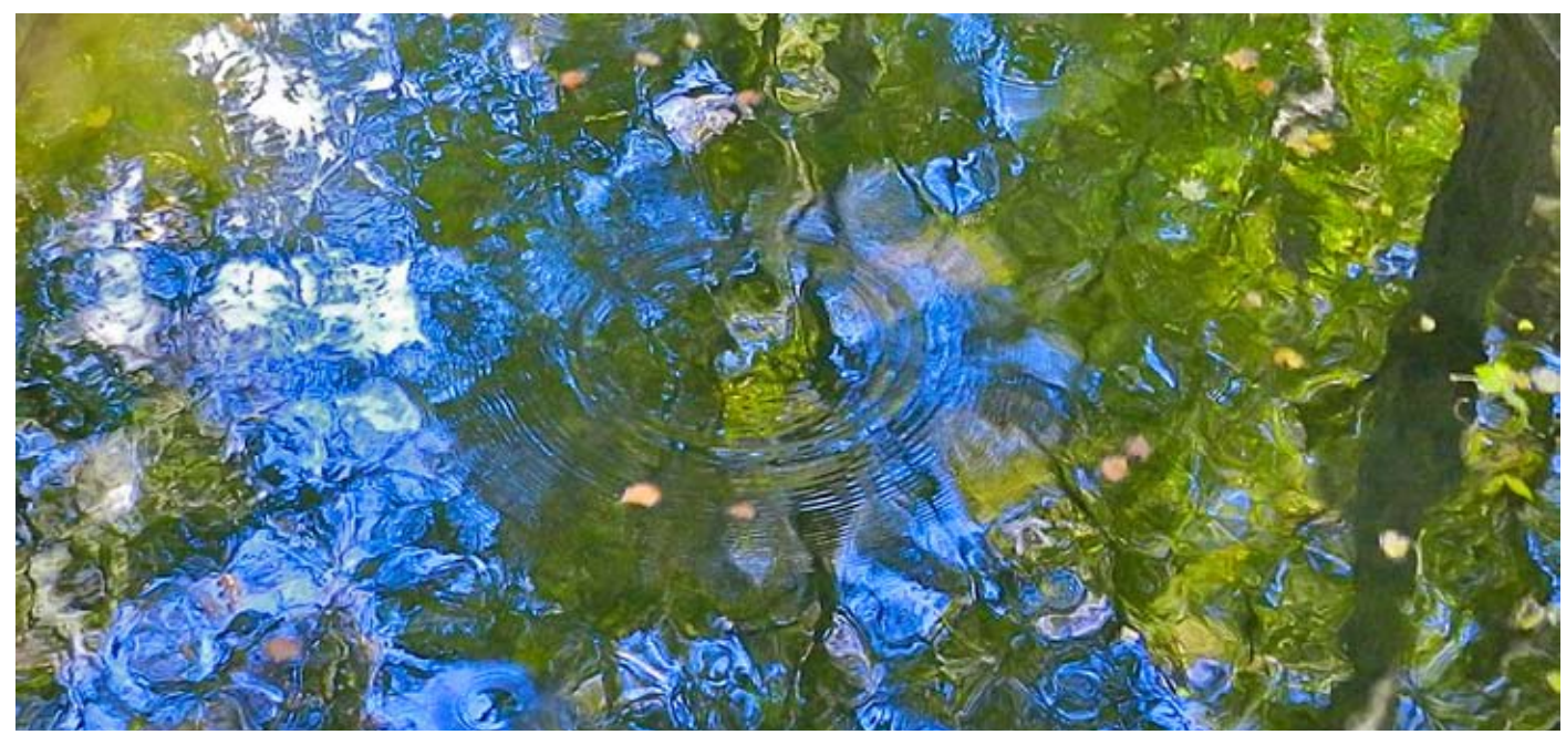
"Small Stream Review"

This is my first book review for the newsletter. I plan on reviewing a fly fishing book, DVD, or website each issue. If you would like to submit a review or suggest a review, please let me know.