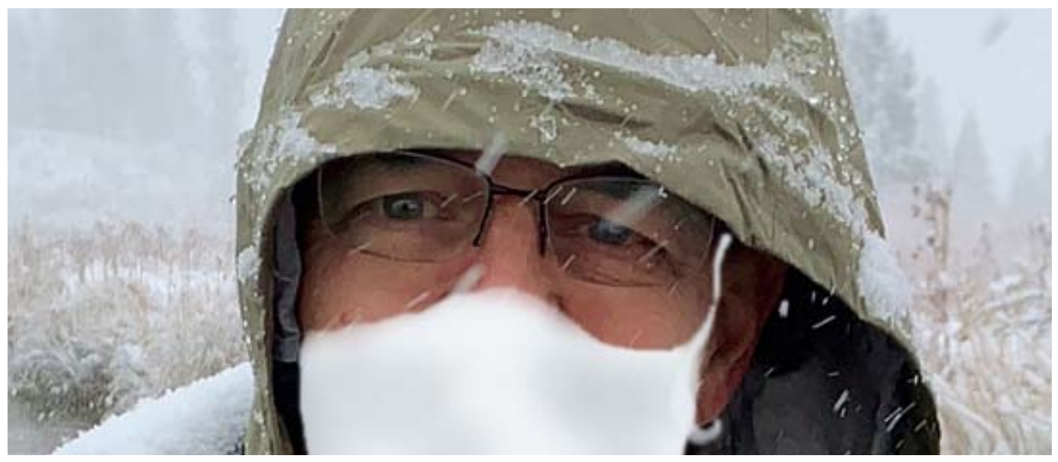
Antietam Fly Anglers Meeting Minutes 2/20/20

Here is the minutes from the Board Meeting. However, as you are all well aware, most of the below events were cancelled to comply with the various state orders in response to the COVID-19 virus.