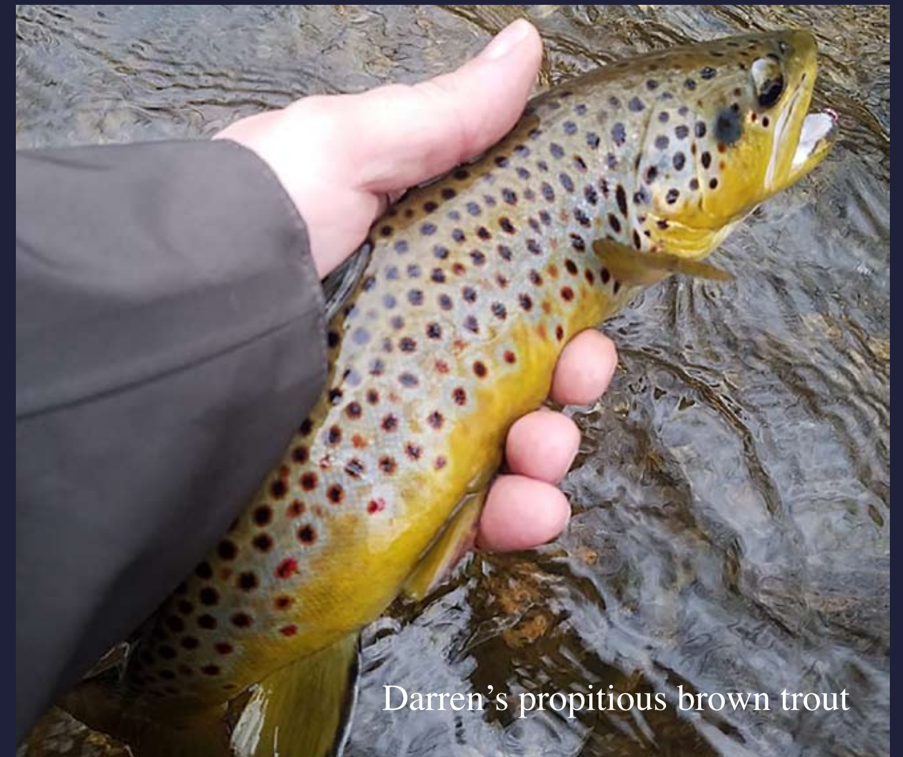
Darren's propitious brown trout

Down stream Darren hook a nice brown with what else a (red zebra midge) size 18. I didn't walk away feeling frustrated, if anything, why not merge Japanese Tenkara and Euro Nymphing together, it would make fishing in tight over hanging foliage a joy. Like anything else "You got to get your feet wet."